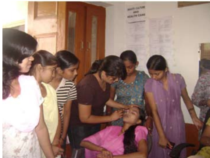
Trainees of the beauty culture batch watch their trainer carefully

In India there is a crime against women in every three minutes, one rape every twenty nine minutes and one recorded case of dowry death in every seventy seven minutes. Cases of cruelty meted out by husbands and in laws are seen in every nine minutes.