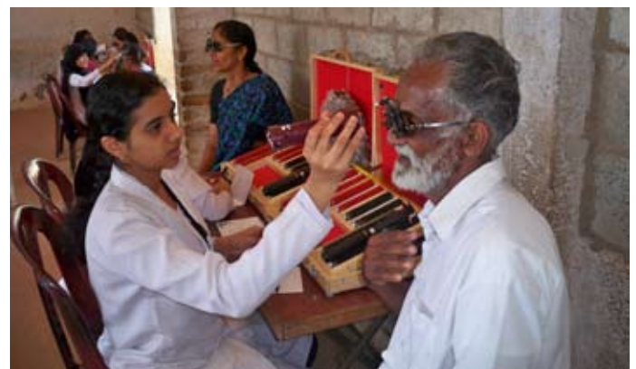
Free eye medical camp conducted by us in Kozikode.

Good news from Agra as well. In the month of June, a special insurance camp – the Rajeew Gandhi Artisan Health insurance cards camp, was conducted by the Handicraft Department at Nai ki Mandi, Tajganj. A large number of stone carving artisans benefited from this camp. e card camp