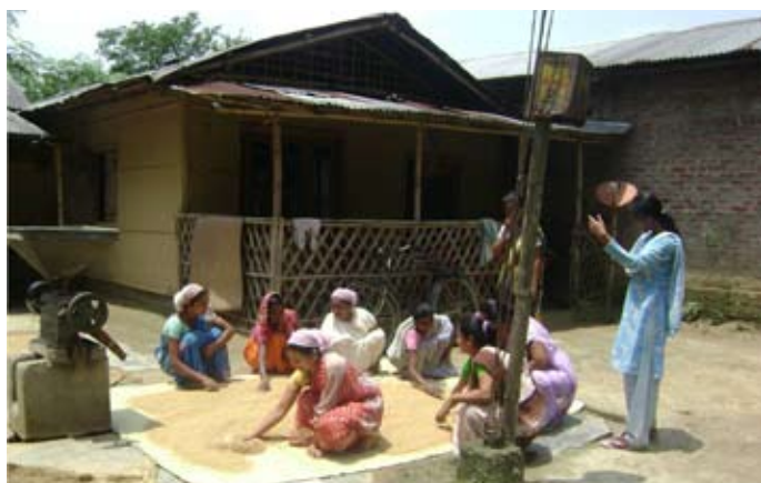
Members of a Self Help Group being briefed on various income generation activities.

ACM GIDF's Self-Help-Group movement is going great guns in Assam. In fact, the 'Sakhi' project has brought home a new ray of hope for countless village women, who are lapping up this opportunity to carve their own identity and contribute to the family income. The best achievement, of course, remains the increased self