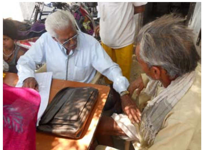
A Doctor consults his patient during a health camp conducted by us in Guna,MP.

In the month of May, ACM GIDF distributed around 4000 condoms through various channels – including condom boxes installed near highway eateries and garages.