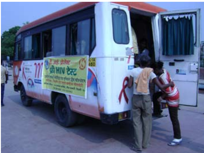
People get themselves checked for HIV/AIDS

In Guna, we have taken up the fight against HIV on a war footing. Besides counseling High Risk Groups through a unique 'Awareness Park' project – we also conduct HIV tests and pre and post test counseling in