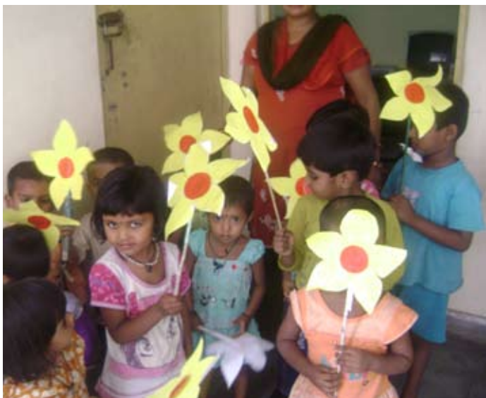
Students participate in the 'Art & Craft' workshop held in their learning center