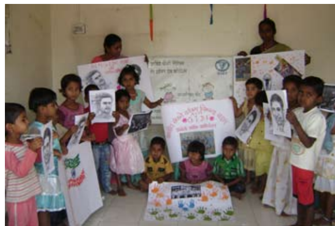
Painting done by the students to support the Indian cricket team during the World Cup

In April, we celebrated the ICC world cup victory of the Indian Cricket Team in all our centres – the children were asked to paint on the theme. At the Delhi centre, we organized a unique theme based two days Art and Craft workshop – keeping the hot summer of Delhi in mind, the children were taught to make paper fans, ice-cream cones, paper flowers of soothing colours, paper dolls etc. All Delhi centres also organized summer camps during vacations in