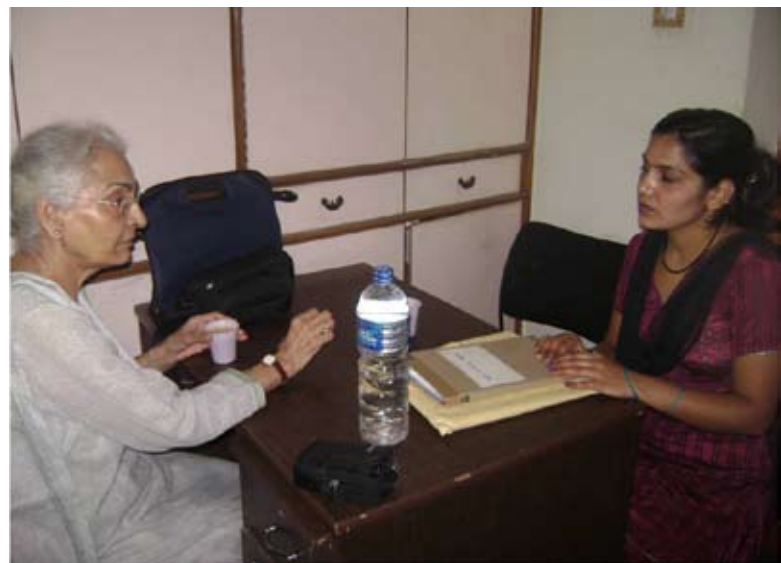
Legal counseling conducted at the center

The Gender Resource Centre-Suvidha Kendra is central component of SSS - the human interface between community and the mission convergence. While the Suvidha Kendra component facilitates community's access to welfare benefits, the Stree Shakti component institutes direct intervention programs for gender empowerment leading to holistic development of women.