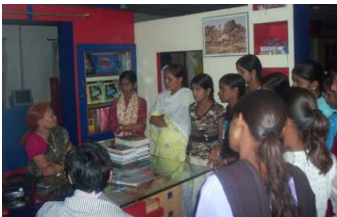
e-Shiksha students meet the head of the Digital Library in Guna

We also conducted a number of other outreach activities under the e-Shiksha umbrella– including a special meeting session with the Head of the Digital Library, Guna. In this interaction, the girls learnt about the importance of books as well as how a modern library system functions. To add on to the fun quotient, we arranged educational tours/picnics at Shiv & Sai temple, AB Road.