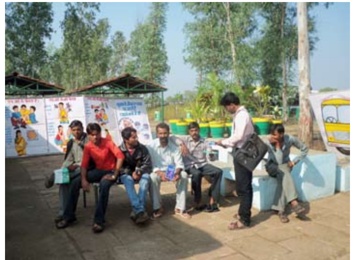
Truckers are counseled about the ways to prevent the deadly disease

the region. Positive cases are referred to the local ART center for free treatment.