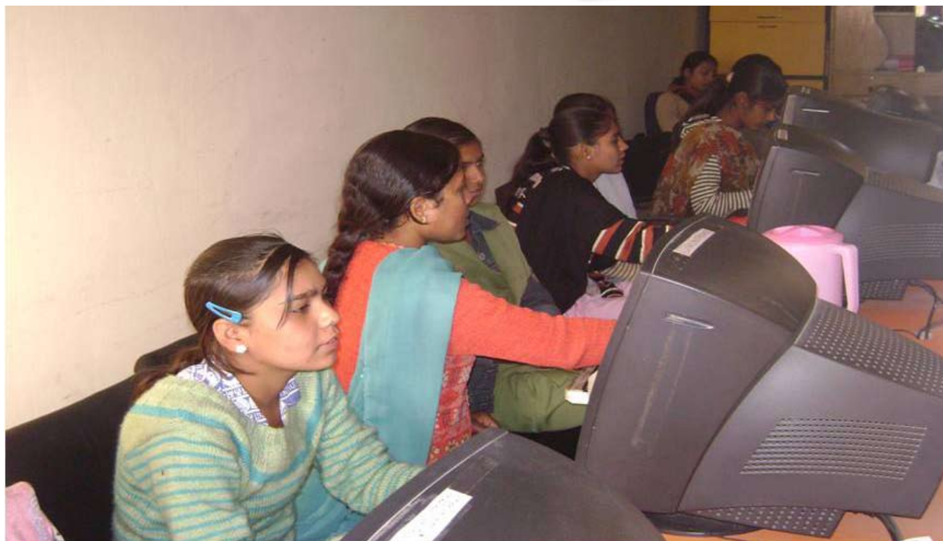
Free computer classes for girls in Mehrauli, Delhi

In India there is a crime against women in every three minutes, one rape every twenty nine minutes and one recorded case of dowry death in every seventy seven minutes. Cases of cruelty meted out by husbands and in laws are seen in every nine minutes.