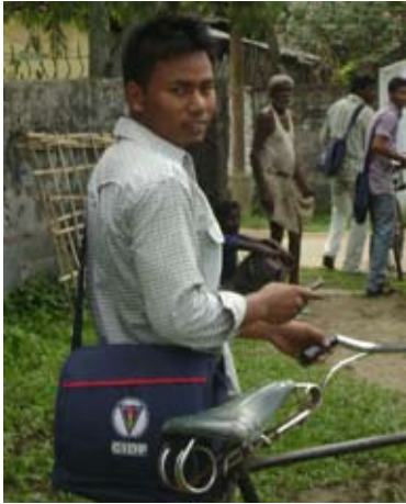
A student from the SGSY project on his way to the training center

Under Government of India's special Swarnjayanti Gram Swarozgar Yojana (SGSY) program – in the month of June we included one more centre of vocational training at Tengakhat Block, Assam. In Dibrugarh district, now we have three training centres in three different blocks – Barbaruah, Lahoa and now Tengakhat . Both Barbaruah and Lahoa are conducting courses that were started in April 2011 – including welding, fitter, retail and bedside assistant courses.