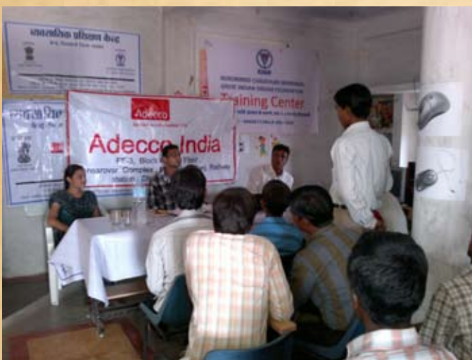
Campus placement at one of our SGSY Training centers in Madhya Pradesh