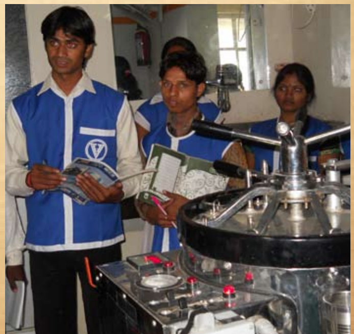
SGSY Medical Assistant Trainees in a Hospital exposure visit