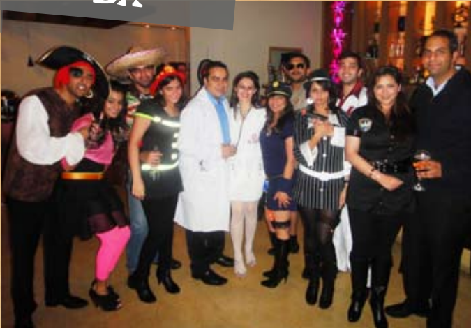
Fun and funds walk hand in hand in the ACM GIDF Fundraiser party in Boston