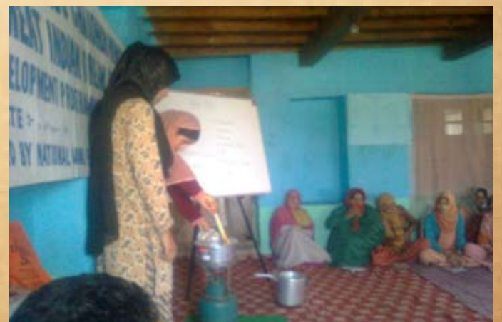
Kashmiri women participate in a pickle-making class supported by NABARD

A number of workers trained by our programs are now being absorbed in local companies at responsible posts – a fact that encourages us to strive for more.