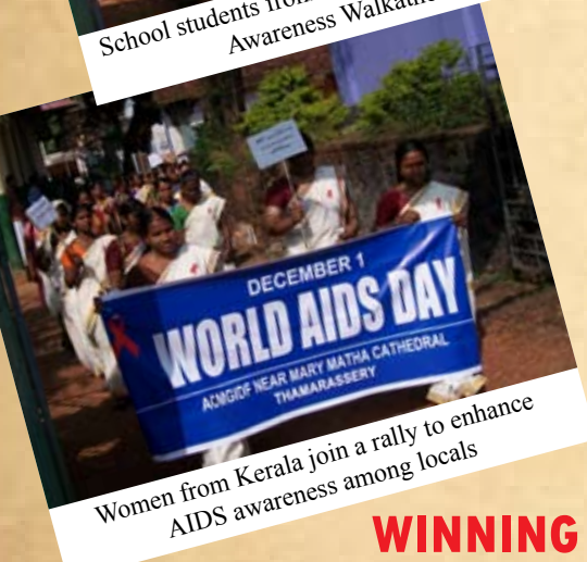
Women from Kerala join a rally to enhance AIDS awareness among locals