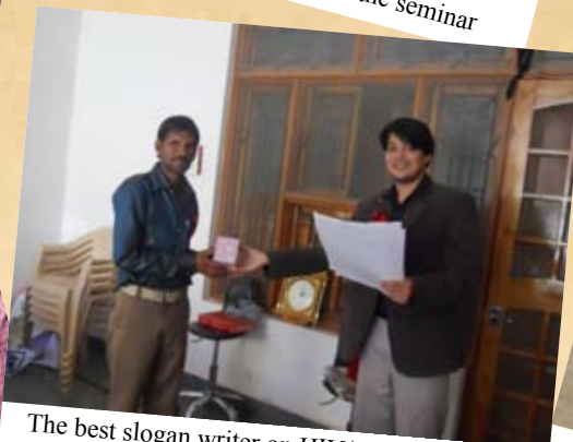
The best slogan writer on HIV/AIDS receives his prize at Guna, Madhya Pradesh