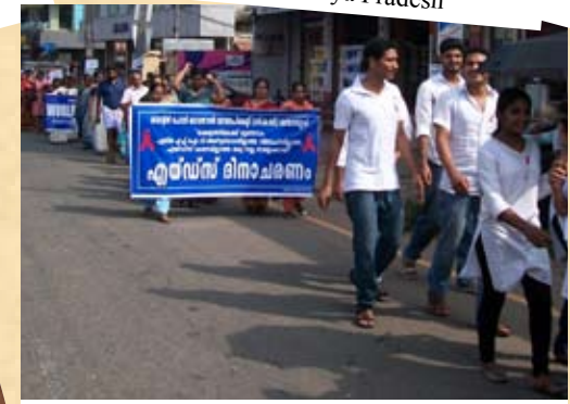
AIDS awareness procession in Kerala finds support across age and gender groups