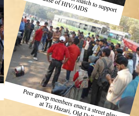
Peer group members enact a street play at Tis Hazari, Old Delhi