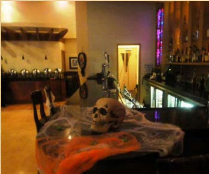
The unique décor at the theme bistro Tantric, venue for the fund-raising event