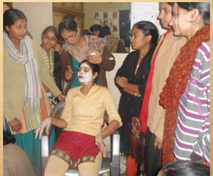
Students from our beautician course programme in GRC SK

Nutrition is another area that has eluded women, mainly because of their second citizen status in India. Through GRC, ACM GIDF holds nutrition camps that teaches women low-cost but effective nutrition for both them and