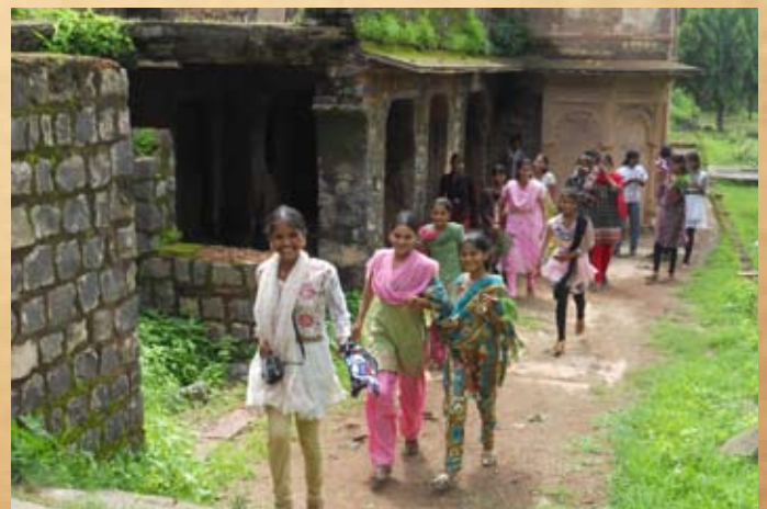
e-Shiksha students from Madhya Pradesh on an educational field-trip cum picnic

Besides regular activities like formation of new batches, e-Shiksha students celebrated the International Hand Washing Day on 14th and 15th October. A girl’s batch from Ahmadpur in Madhya Pradesh was taken for an exposure visit to GAIL plant. They learnt a lot about CNG production. 35 e-Shiksha boys from Guna in Madhya Pradesh were taken for an interstate tour to Rajasthan and UP to give them an exposure to different cultures.