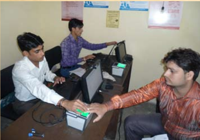
The GRC project also backed up as UID Card making and distribution centers