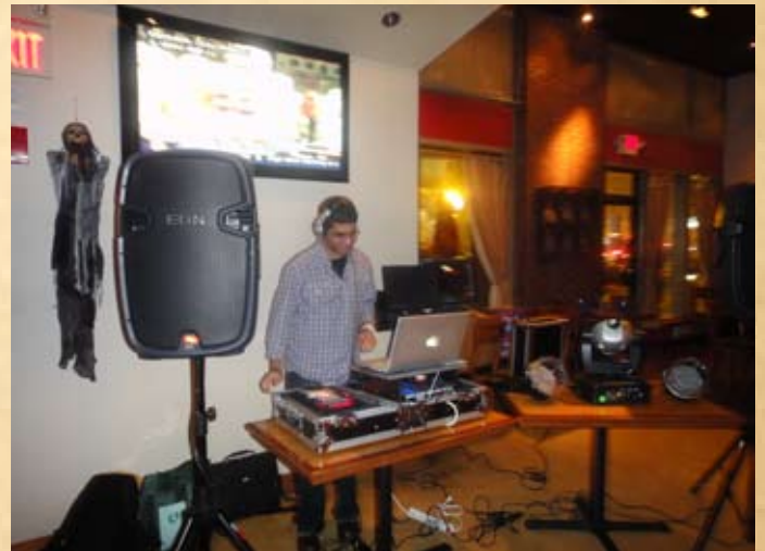
The DJ pumps up the night with Indian theme tunes and desi remixes

All the guests were entertained by one of Boston's best DJ, who not only played the latest Bollywood songs but tuned it with the 80's remixes and a few American songs as well. Even though the weather condition was not very cooperative and accompanied the night with a severe snow storm, but that didn't stop the attendees from supporting ACM GIDF's cause, as the proceeds of this event was donated for the education of the less-privileged children in India.