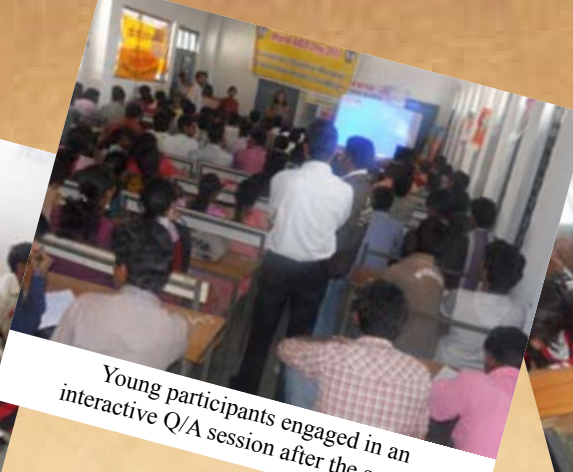
Young participants engaged in an interactive Q/A session after the seminar