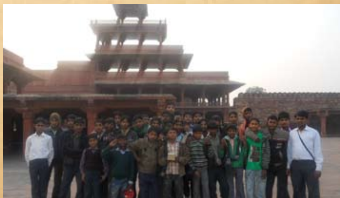
e-Shiksha students from Madhya Pradesh reach Jaipur in Rajasthan for an exposure visit