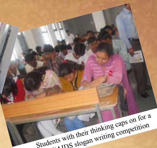
Students with their thinking caps on for a HIV/AIDS slogan writing competition