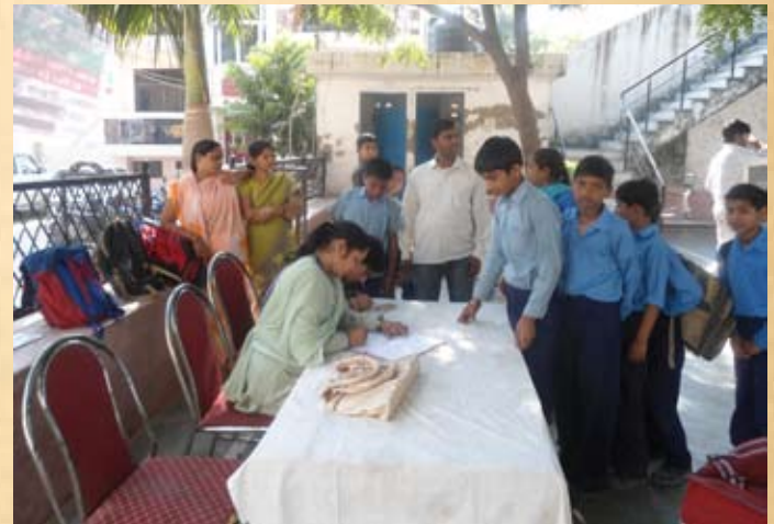
Health Camps organized at Arya Nagar and Sultanpur schools in Delhi