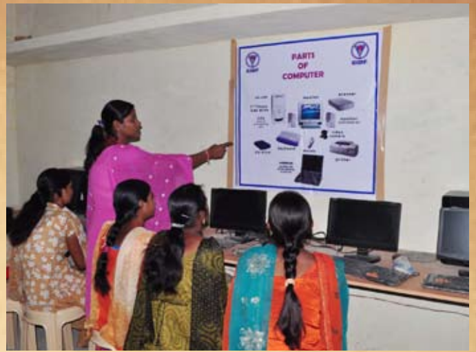
Vocational Training imparts basic knowledge of computers to students