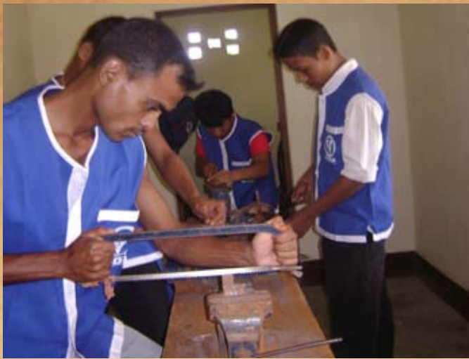
Masonry training students under SGSY project in their workshop