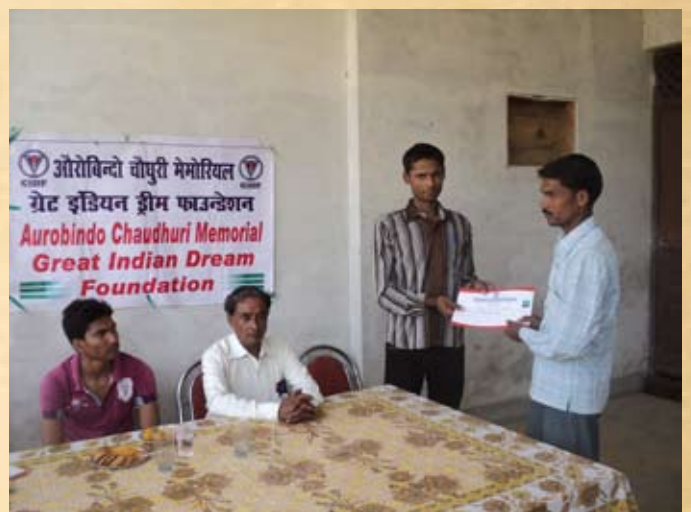
Certificates being distributed to candidates on completion of their vocational training programme