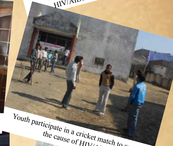
Youth participate in a cricket match to support the cause of HIV/AIDS