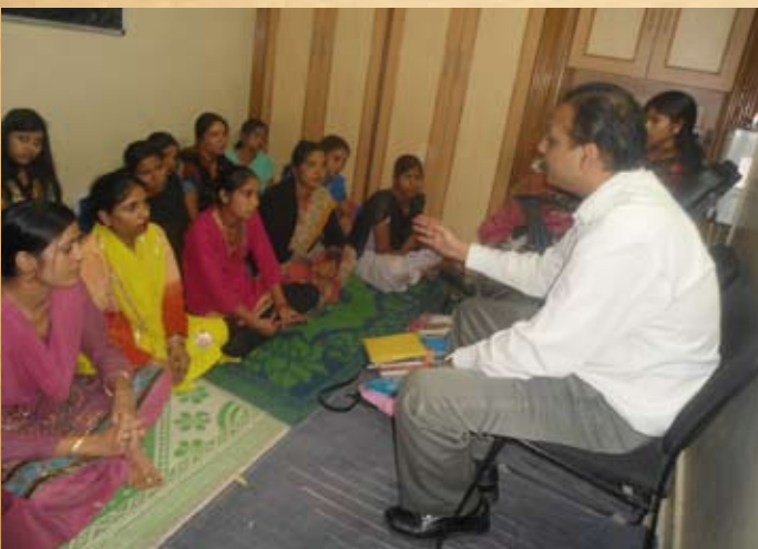
Mass awareness camps to sensitize women of their legal and social rights