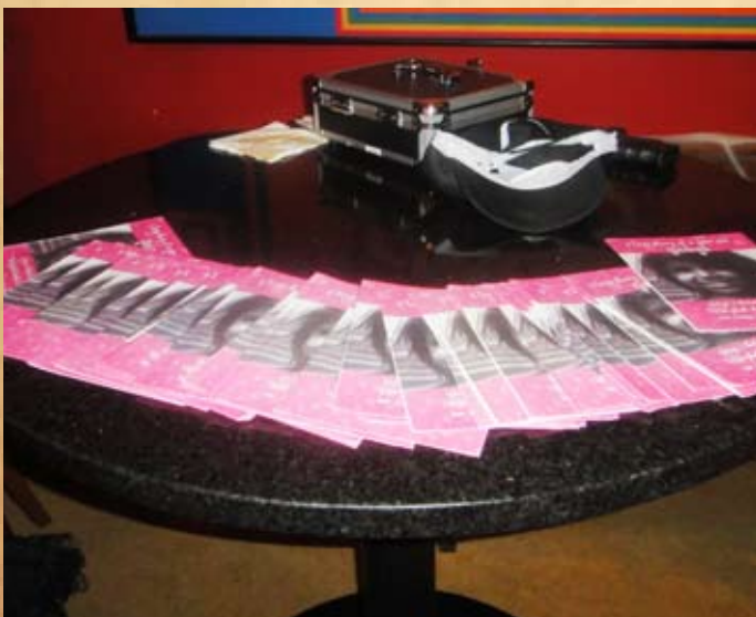
Humari Gudiya campaign reaches downtown Boston through these pamphlets