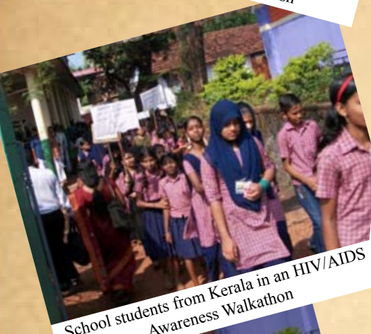
School students from Kerala in an HIV/AIDS Awareness Walkathon