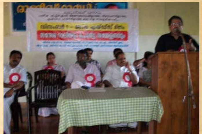
District Administrators from Kerala addressing a public meeting on HIV/AIDS