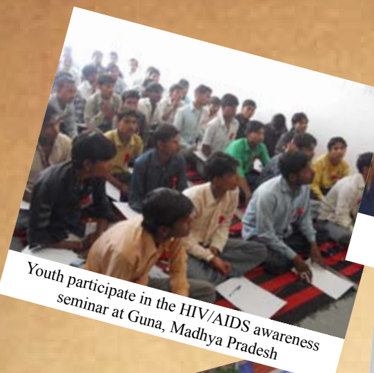
Youth participate in the HIV/AIDS awareness seminar at Guna, Madhya Pradesh