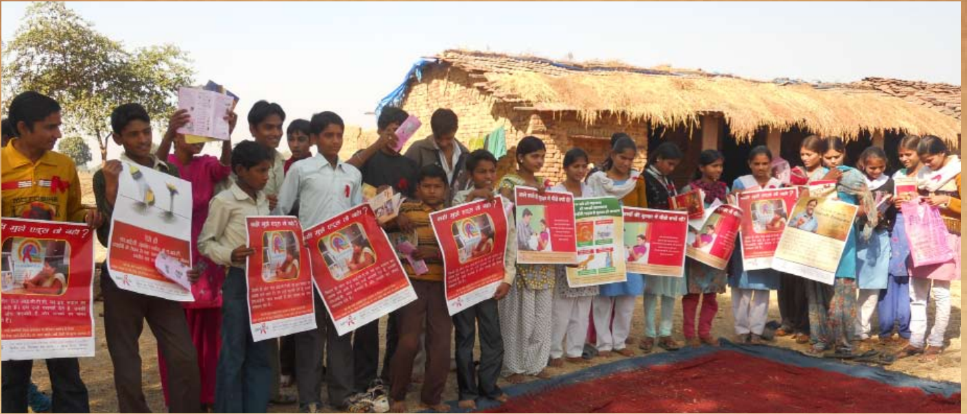
Young adults sensitized, involved and provided with posters on HIV/AIDS to encourage direct action in their neighbourhoods