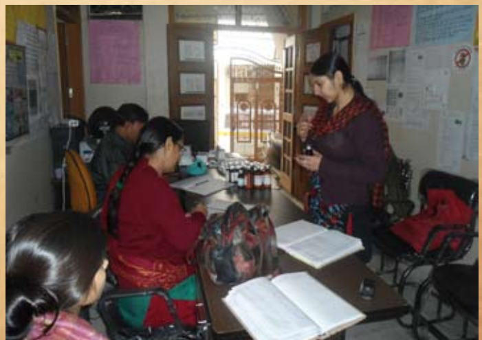
Our Fully operational OPD at Mehrauli has been a boon for impoverished patients