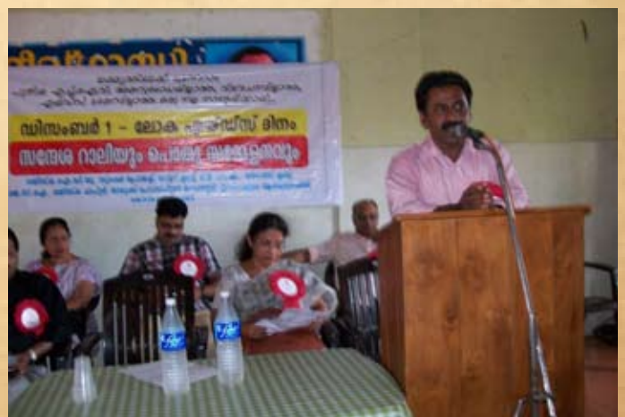
ACM GIDF representative in Kerala explains our future strategy to the public