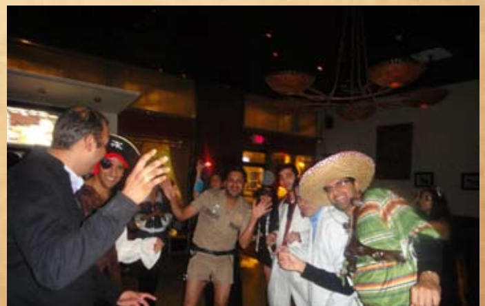
Guests at the costume party revel in the spirit of the All Hallows' Eve