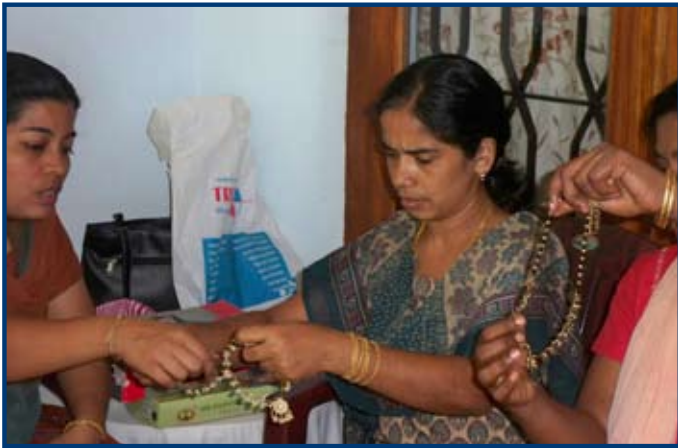
Members of a self help group in Kerala participate in a artificial jewellery making workshop

Kozhikode, trained them on how to make the latest designs.