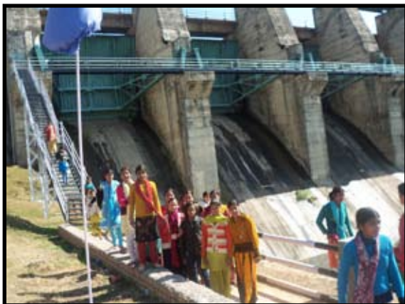
e-Shiksha students visit the Govind Sagar dam

Govind Sagar Dam. The purpose was to expose the girls to the importance of water conservation.