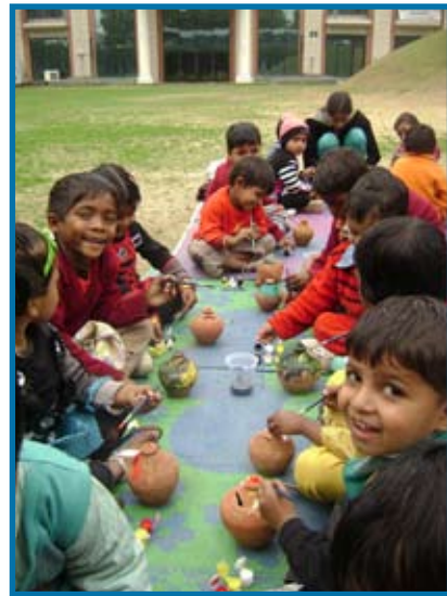
Children during the painting competition

In the month of February, Delhi ECD centre kids were taken to the IIPM on Valentine's Day , to spend some time with young management aspirants. After a session of dance and revelry at the IIPM Cafeteria, the kids were taken