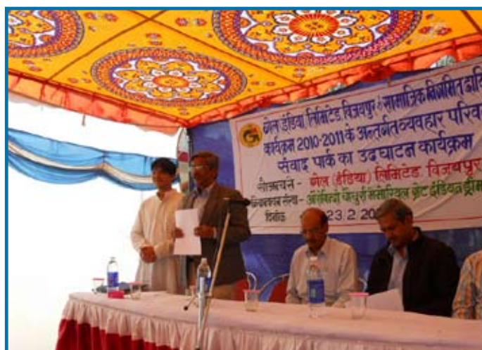
The new BCC Park Inauguration function held in Guna, M.P.

To facilitate this, we selected a location near a truck halt which is next to a LPG/CNG station where most of these truckers come. The new park will be a place where they could be educated by showing movies, involving them in interactive sessions while enjoying games like carom board & cards. This makes the entire environment much lighter, helps them open up and understand what we want to communicate to them, in a much better manner.