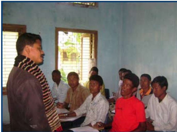
A session being on conducting retail marketing in Assam

GIDF conducts a range of training programmes for youth who fall below the poverty line (BPL category). Our projects, running in Delhi, Assam,